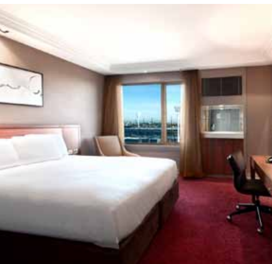
Hilton King Room

Executive Floor guests also enjoy access the exclusive Executive Lounge, offering amazing views and the perfect place to relax in comfortable seclusion while enjoying complimentary breakfast, refreshments throughout the day and pre-dinner drinks and canapés in the evening.