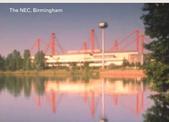
The NEC, Birmingham